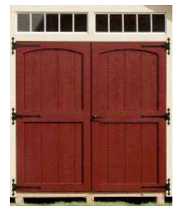
Classic Double Door with Transoms Above