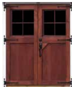
4-Lite Craftsman Door with Latch Upgrade