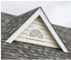
7' Windsor Dormer with Half-Round Window