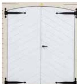
Double Chevron Door