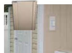
Vinyl Board & Batten Siding