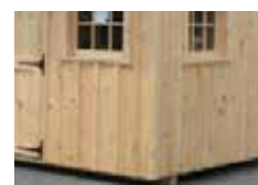
Pine Board & Batten Siding