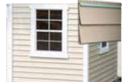
Vinyl Clapboard Siding