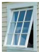
Tilt-Out Window Upgrade