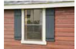
Stained LP Lap Siding