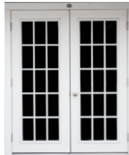
Double 15-Lite Door