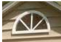
Half Round Window