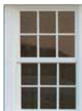
Vertical Slider Window