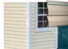
Vinyl Dutch Lap Siding