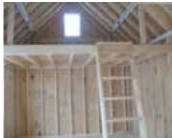
Loft with Ladder

Add the features you want to create a shed that you love