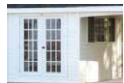
Hardie Plank Siding