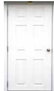
Fiberglass Single Door