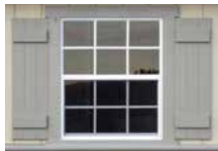
30" x 36" Standard Window