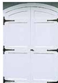
Double Eyebrow Door