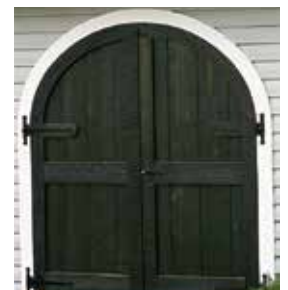
Double Arched Door