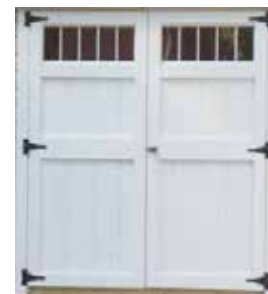
Classic Double Door with Transoms