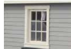
Painted LP Lap Siding