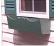
Regular Flower Box