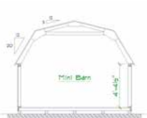
KEYSTONE MINI BARN