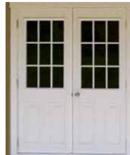
Double 9-Lite Door