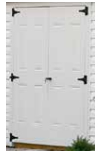
Fiberglass Double Door