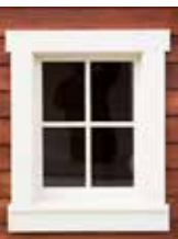
4 Lite Window