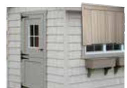
Vinyl Shake Siding