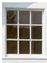
9 Lite Window