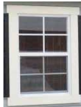
24" x 36" Standard Window