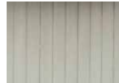
Painted Dura-Temp Siding