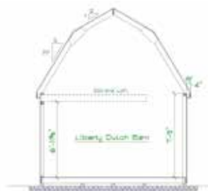
LIBERTY DUTCH BARN