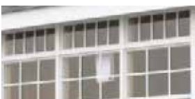
Transom Windows (above windows)