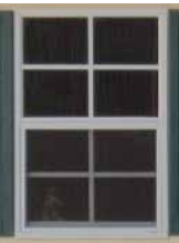
18" x 27" Standard Window