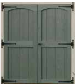
Classic Single or Double Door