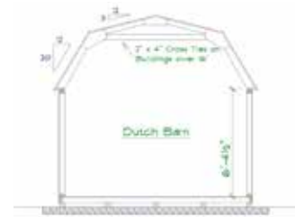
KEYSTONE DUTCH BARN