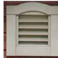
Classic Gable Vent