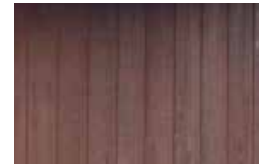
Stained Dura-Temp Siding