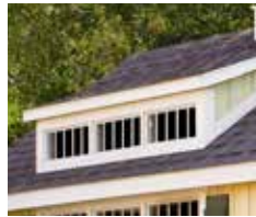
3 Transom Mini Shed Dormer