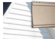
Vinyl Beaded Siding