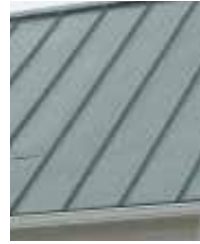
Standing Seam Metal