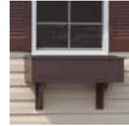
Classic Flower Box