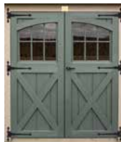
Carriage Double Door